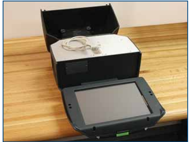
MobiLab X50 facilitates screening of components for compliance with RoHS/WEEE EU Directives for banned substances including Cd, Pb, Hg (total Cr and Br).

Alloy Applications: Lower limits of detection for many elements with the same, lightning-fast sorting of handheld XRF.