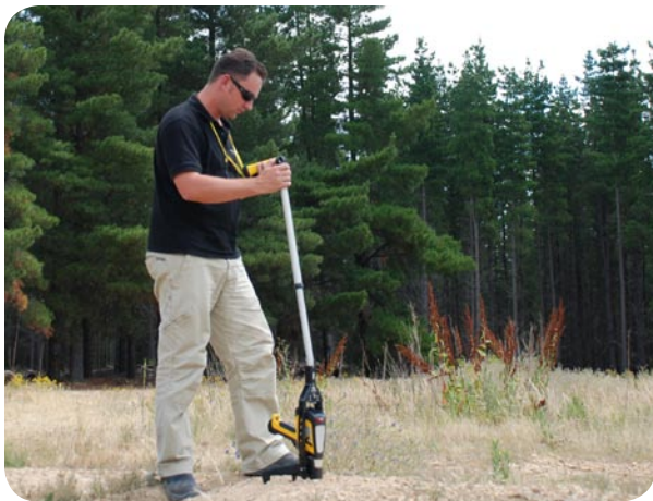
In-situ Soil Analysis with Soil Stick