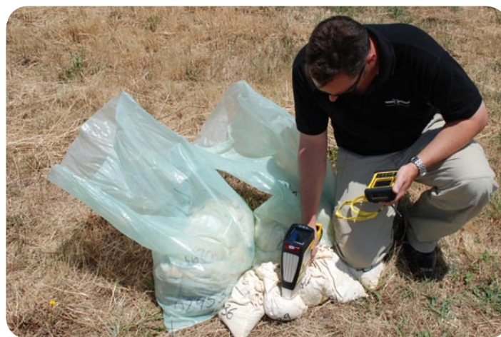
Drill Chip Pre-Screening