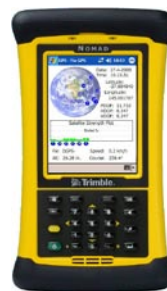
Real-Time, Spatially Registered XRF Data