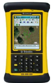
Mobile GIS - Use All Your Layered Data in the Field