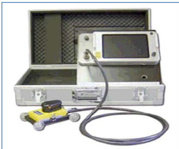
Figure 1. The system includes a field rugged all metal controller and high impact glass monitor.

Features include the ability to rapidly scan areas for 2D locating and to mark targets or collect data on a grid mat supplied with the system, for "in the box" 3D imaging in the field for instantaneous results.